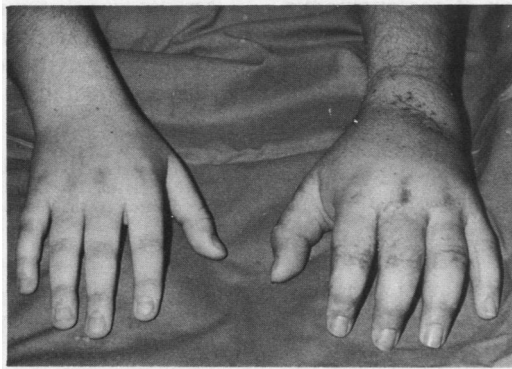
Figure 1 Diffuse oedema of the left hand. Note the hallmark of the tourniquet around the wrist.