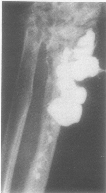
Wrist radiographs taken in two planes.

Scott, and Huskisson on lymphoedema as an extra-articular feature of rheumatoid arthritis. 1 The phenomenon of lymphoedema of a limb complicating rheumatoid arthritis is well recognised, and I have successfully treated two patients with unilateral hand and forearm swelling with daily compression methods (Flowtron apparatus).