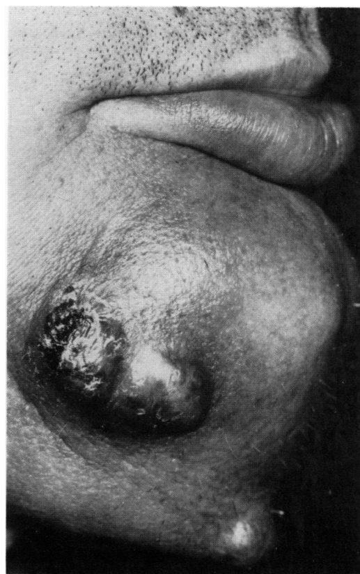
Figure 1 This shows a mandible expanded by the tumour mass which has ulcerated through the skin.

and lower jaw, and radiography showed typical Pagetic changes in the mandible. Treatment with etidronate 400 mg daily, calcium, and vitamin D (25 µg calciferol) was started. His serum alkaline phosphatase level before treatment was 1690 IU/l. After six months' treatment this level had fallen to 369 IU/l but with only a modest improvement in his symptoms. Within three weeks of stopping treatment the serum alkaline phosphatase level had risen again to 1150 IU/l. A second course of etidronate was given with a nadir of alkaline phosphatase of 347 IU/l. He then had two courses of mithramycin (15 µg/kg daily for five days per course), with improvement in his symptoms, followed by combinations of treatment with etidronate 400 mg daily and salcatonin 100 units daily, covered by pizotifen (1.5 mg daily) to reduce side effects. 3 He was then able to tolerate salcatonin but continued to have severe lower jaw pain. After this he developed an ulcerating mandibular swelling with loosening of the lower four incisors (fig 1). The mass was biopsied and