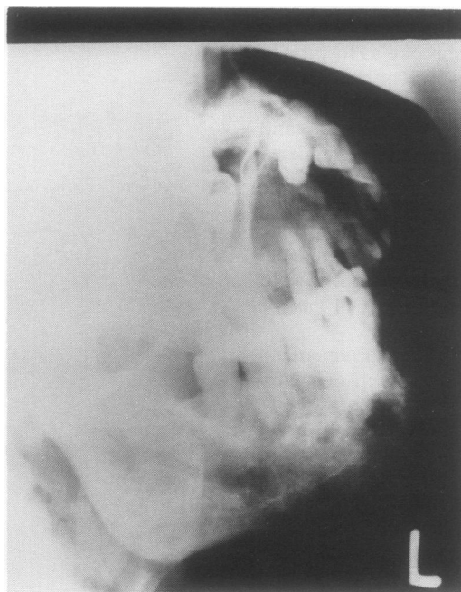
Figure 3 A radiograph of the mandible showing lytic lesions and bony erosion.

bodies. Treatment with etidronate and salcatonin continued with the lowest value of serum alkaline phosphatase so far achieved of 329 IU/l.