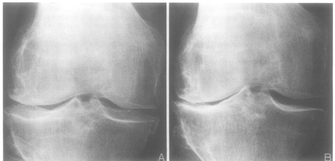
Figure 3 Standard radiograph of an OA knee in the fully extended (A) and the standing semiflexed (B) views. In full extension the femoral condyle rises up on the cartilage remaining at the anterior margin of the tibial plateau, resulting in an increased inter bone distance compared with that seen in the semiflexed view.

In the reference group, precision of microfocal measurement of JSW in the medial compartment was improved by 50% of that obtained in the OA knees (MFPA in table 1). Here again, the larger variation in JSW measurement within the OA group may have resulted from variations in focal cartilage loss in the two articular surfaces, or from small alterations in the position of the femur on the tibia associated with cartilage loss and the resulting laxity in the ligaments of the joint.