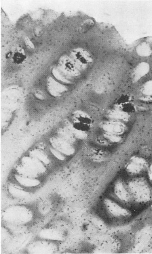
Fig. 3.—Proximal tibial growth plate of a normal rat showing labelled nuclei in the growth columns. Autoradiograph, counterstained neutral red, \times 500 .