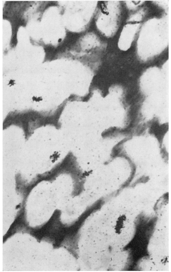
Fig. 4.—Labelled nuclei in proximal metaphysis of normal rat tibia. Autoradiograph, counterstained neutral red, \times 500 .

of the autoradiographs showed that hydrocortisone caused a reduction in the number of radioactive growth plate nuclei and this was confirmed by measurements of the labelling index (labelling index = ratio labelled nuclei : total nuclei). The range for the normal growth plates was 0.055 to 0.134 (mean 0.08) compared with a range of 0.005 to 0.044 (mean 0.023) in the rats treated with hydrocortisone. This difference is statistically highly significant ( P < 0.001 ).