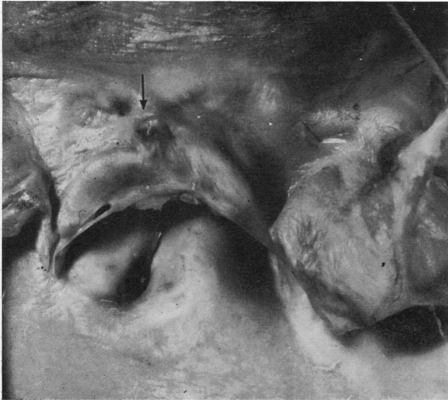
FIG. 2 Autopsy appearance of calcific nodule on central cusp in Case 3.

cases the lumen of affected arteries was patent, if reduced in diameter. Inflammatory cell infiltration was minimal or absent. In one vessel in the renal pelvis the wall was calcified.