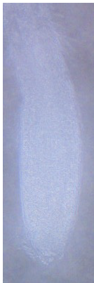
pH 5.7 Buffer