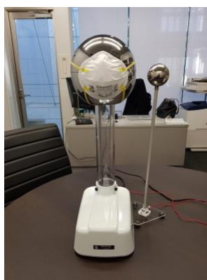
Figure S1: A van de Graaff generator

*Correspondence: miles@designlab.ac, kaori-s@iis.u-tokyo.ac.jp