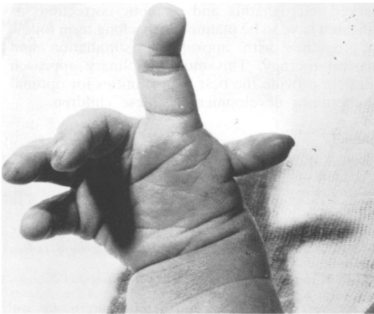
FIG 2 Right hand of case 1. Note hypoplastic thumb and deformity of index finger.

thumbs were hypoplastic and proximally inserted, and there was moderate radial deviation of the hands and clearly limited extension of the elbows. Both index fingers were radially deviated with clinodactyly. The heart was normal. There was mild overlapping of the toes. The rest of the physical examination was within normal limits.