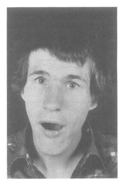
FIG 1 The facial features of the proband at 21 years of age.

At the age of 23 years the proband was examined by one of us (JWEO). He was a tall, restless, mentally deficient man with an occipitofrontal circumference of