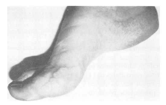
Figure 3 Typical palmoplantar hyperkeratosis in an adult foot.

same day by a single, experienced audiometrician under standard conditions in a sound-proof room. A Grayson Stadler GSI 16 audiometer was used, presenting test tones via headphones. Tympanometric testing was performed with a Grayson Stadler GSI 33 middle ear analyser.