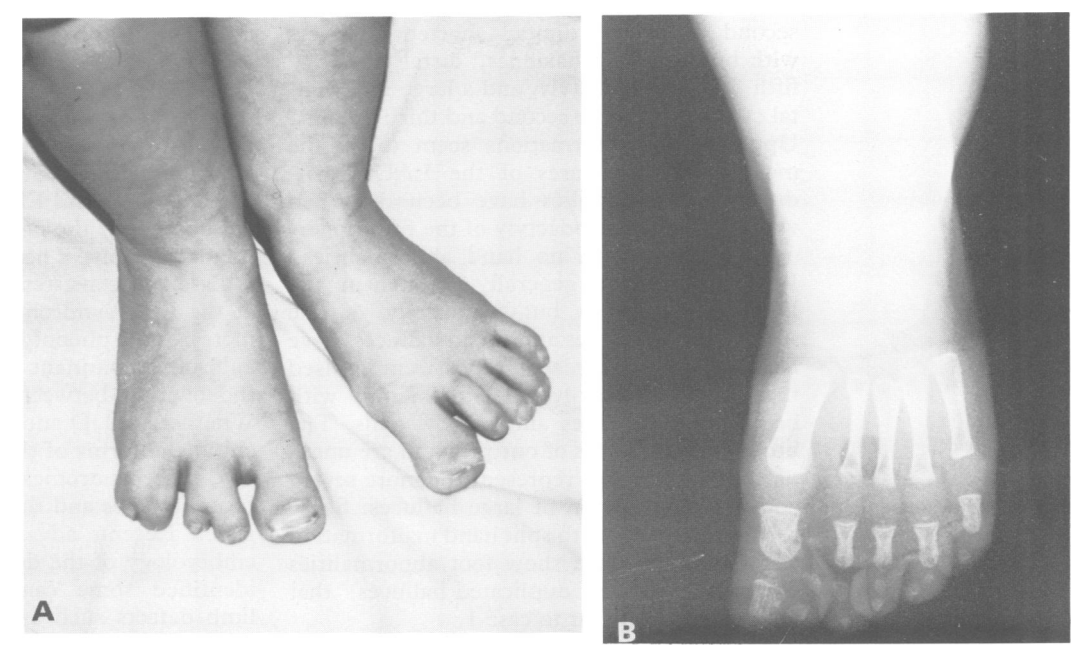
Figure 3 (A) Feet of case 1 showing partial duplication of the big toes and syndactyly between the left 2nd and 3rd toes and 4th and 5th toes. (B) X ray examination of the right foot showing duplication of the hallux.

tory showed recurrent dacryocystitis and a chronic, mild, purulent eye discharge, mainly after sleep. The child had poor lacrimation and the lacrimal puncta were hypoplastic. Scalp hair was sparse and brittle. The palate, skin, and nails were normal. The hands were normal apart from slightly low implantation of the thumbs. Examination of the feet showed soft tissue syndactyly of the left second and third and fourth and fifth toes (fig 3A), with large big toes that were partially duplicated on x ray examination (fig 3B). She had stereotyped and psychotic behaviour. Auditory brainstem evoked potentials and audiogram indicated bilateral sensorineural hearing loss, with no recognisable reaction up to 70 dB. Urine analysis, renal ultrasound, CT scan of the brain, and fundus examination were normal. Chromosome analysis was normal 46,XX. Metabolic screening showed no abnormalities. The maxillary deciduous right second molar is missing at 30 months of age.