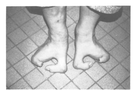
Figure 4 Bilaterial split foot of case 2.

The mother of case 1 was 25 years old and had typical split foot deformity of both feet (fig 4) and severe malformations of the upper limbs with two ulnar digits on each hand. Radiologi-