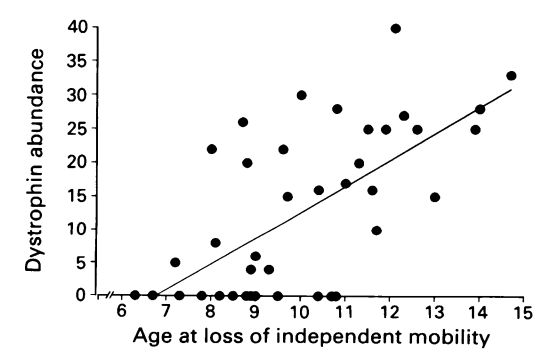
Figure 2 Age at loss of independent mobility and dystrophin abundance estimated from blots labelled with the rod MAb Dy4/6D3. In general, estimates of dystrophin abundance increased with the length of time that boys maintained independent mobility. The correlation coefficient for the data on these 40 patients is 0.66 which is highly significant (p < 0.00001).

ling in addition to a small percentage of fibres with clear dystrophin positive labelling. This was observed rarely in group 1 severe DMD patients, more frequently in group 2 milder DMD patients, and was the most typical labelling pattern seen in the group 3 intermediate D/BMD biopsies.