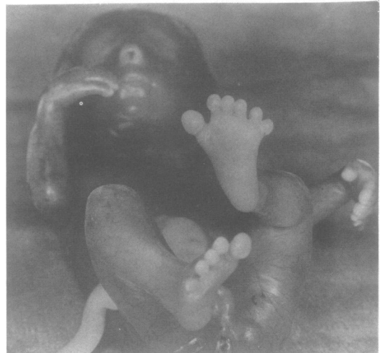
Figure 1 Postmortem view of case 1 showing single nostril, omphalocele, postaxial polydactyly of left hand and foot, and splayed, broad hallux.