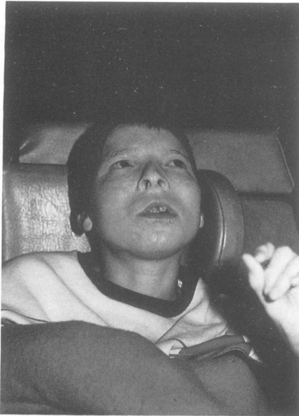
Figure 4 III-7 aged 25 years.

born by spontaneous vaginal delivery but according to parental report "he was stuck" during delivery. His birth weight was 2730 g. At 1 year of age he developed convulsions which have persisted. Severe mental and growth retardation was apparent from infancy and at 25 years he still has difficulty sitting unsupported. He is unable to walk or stand and has no words. He also tends to put his hand to the back of his throat to induce vomiting.