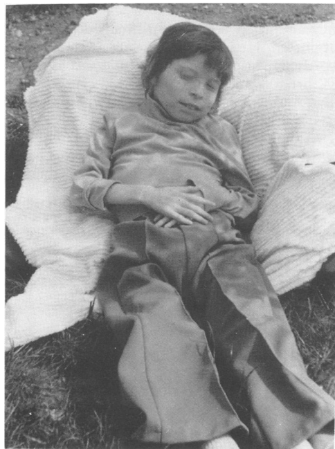
Figure 3 III-7 aged 12 years. Features include microcephaly, triangular shaped nose with anteverted nares, wide mouth with prominent lower lip and large central incisors.