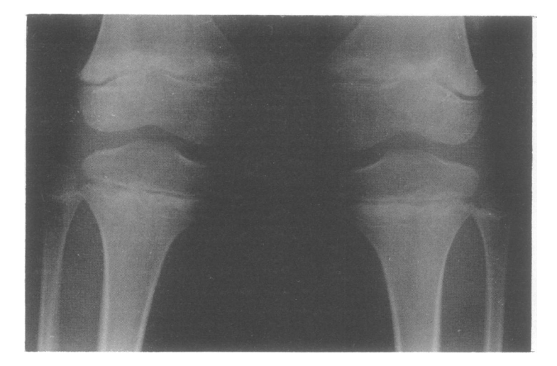
Figure 7 Case 3 at 9 years showing metaphyseal irregularities of the knee.