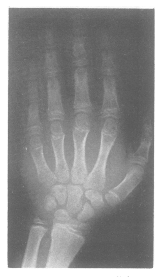
Figure 3 Case 1 at 8½ years showing slight metaphyseal irregularities and shortened bones.

Skull and spine radiographs were strictly normal.