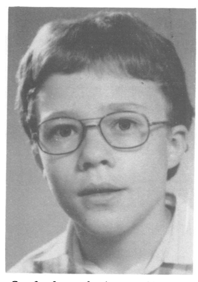
Figure 6 Case 3 at 9 years showing normal hair.

Examination of the hair was unremarkable under