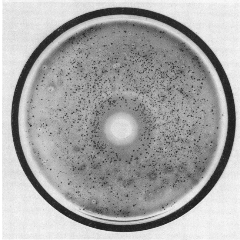
FIG. 1.—Photograph by transmitted light of blood agar plate culture of normal saliva. The hole in the centre contained penicillin solution, 10 units/ml. The dark colonies in the inner zone of growth are those of a Neisseria . The nearest colonies of streptococci, recognizable by the hæmolysis which they produce, are 1 cm. from the hole, indicating that they are of approximately normal sensitivity to penicillin.

The results of quantitative tests of sensitivity to penicillin are given in Table I. Of 40 strains of streptococci isolated from controls all but one were inhibited by 0.25 units per ml. or less and mostly by 0.06 or 0.03 units per ml. Of 74 strains from 31 patients undergoing treatment the great majority were inhibited only by concentrations varying from 2 to 32 units per ml. All these were tested for mannite fermentation with negative results: therefore they were not Str. faecalis .