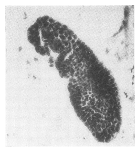
Fig. 1.—A large compact cluster of columnar epithelial cells. Cilia are absent. Notice the peripheral palisading. This cluster contains about 300 cells. (Papanicolaou stain \times 30 .)

who were stated to be not having an attack when their sputa were collected had had one during the previous week, and undoubtedly, in many of them, there still remained some pathological changes of the acute episode.) What is more striking, how-