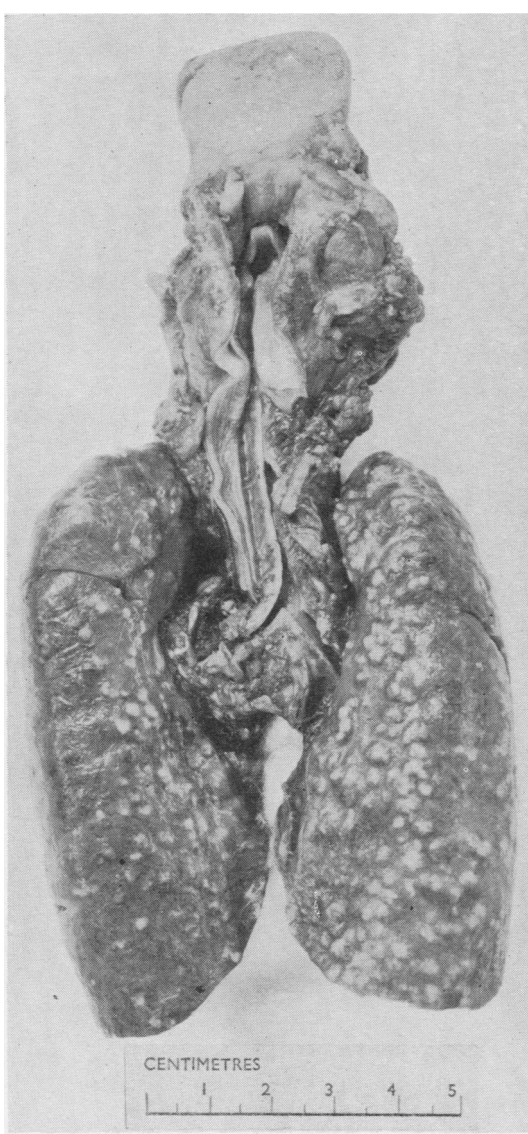
Fig. 1.—Posterior view of the infant's lungs.

felt almost completely solid and retained their shape after removal from the body. On section a vast number of caseous foci, each 2–3 mm. in diameter, were found to be scattered throughout both lungs (Fig. 2). The lesions were all of approximately the same size, and no focus could be found which appeared older than the rest. The right lung was more severely affected than the left and the lesions were rather more numerous at the bases than at the apices. There were many tubercles immediately beneath the visceral pleura, but the pleural cavities were not involved. Several enlarged lymph nodes