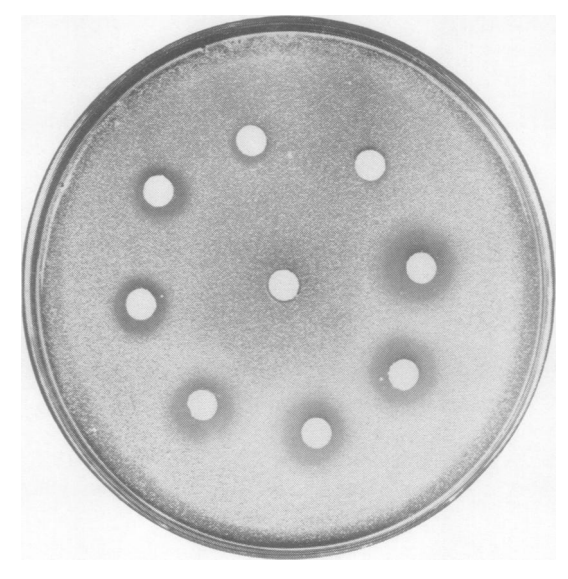
FIG. 1.—A 14 cm. Petri dish showing zones of inhibition obtained with blotting paper discs containing amounts of nystatin ranging from 100 μg, per disc down to 0.78 μg, per disc. The central disc contains solvent only.

chlamydospores. Table II shows the mean inhibitory concentration of all the organisms isolated from patients with Candida infections. The mean inhibitory concentration at 48 hr. was 3.3 \mu g. for C. albicans and 2.9 \mu g. for the other species. It will be seen that the action of nystatin is mainly fungistatic as growth is only partially stopped and continues for some days even in the stronger concentrations. But in the majority of cases no further growth occurs in 25 \mu g./ml. after five days, suggesting either a fungicidal action at this level or death of the organisms from other causes. Subcultures utilizing the whole 5 ml. of media taken from the tubes containing 25 \mu g./ml. did not grow when the nystatin concentration was diluted to below the fungistatic level.