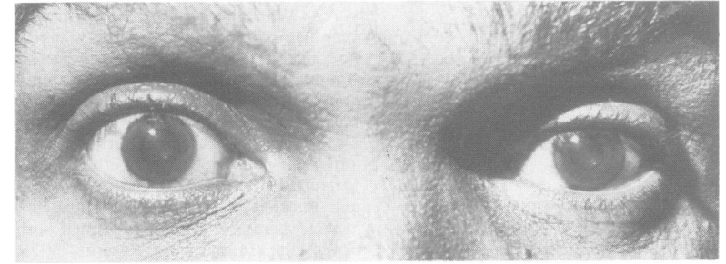
Fig 1 Before instillation of pilocarpine.

Routine laboratory studies were normal. The serum VDRL was positive in a 1:64 titre and the serum FTA-ABS was 4+. Skull radiographs, electroencephalogram, and head CT scan with and without contrast showed no abnormalities. A lumbar puncture revealed clear, colourless fluid with 44 \text{WBC/mm}^3 (86% lymphocytes, 9% polymorphonuclear cells, 5% monocytes), 6 RBC/mm<sup>3</sup>, protein 1.44 g/l, glucose 0.031 g/l, lactate 0.042 g/l, and a positive CSF VDRL in a 1:8 titre. CSF bacterial cul-