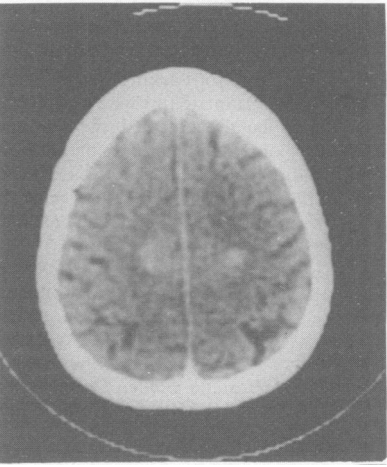
Fig Contrast-enchanced computed tomography scan demonstrating a tumour in the posterior corpus callosum and extending bilaterally into the central white matter of both parietal lobes.