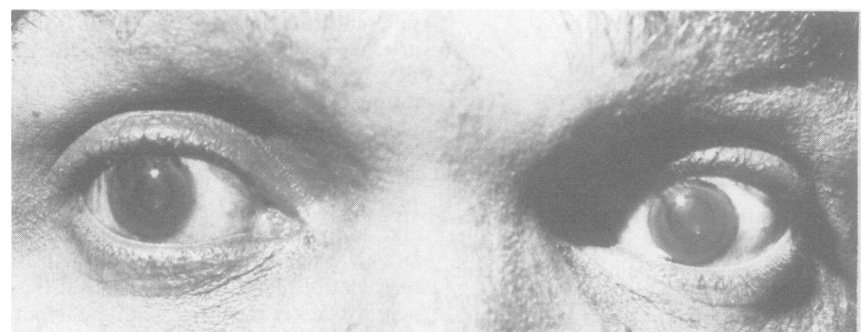
Fig 2 Thirty minutes after instillation of 0.1% pilocarpine to right eye.

tures and AFB smear were negative, and cytology showed inflammatory cells in excessive numbers with no malignant cells.