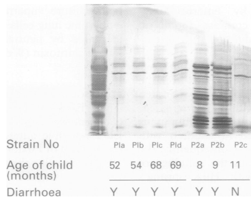
Figure 2 EDTA-soluble antigen profiles of C difficile in two children with Hirschsprung's disease with recurrent episodes of diarrhoea (P1, P2). Antigens were run through 12.5% SDS homogeneous gel and visualised using a silver stain. The first column from the left shows molecular weight markers ( M_r=29K, 45K, 66K, \text{ and } 116K ); Y=yes, N=no.