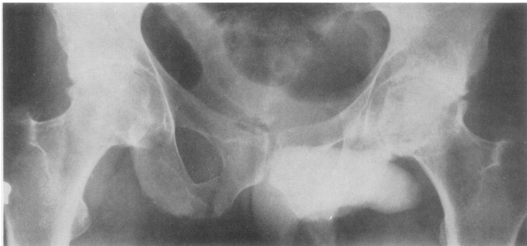
Fig. 2.—Narrowing, sclerosis, and erosive changes in the hips in a man aged 34 years (Case 4, see appendix), with an 11-year history of ankylosing spondylitis and regional enteritis.

(3) Ankylosing spondylitis was diagnosed clinically and confirmed radiologically in four males and one female, and it was thought that a fifth male might well be suffering from this disorder. Three of these six patients had an associated peripheral arthritis. Radiologically, sacro-iliitis was present in a total of eighteen patients, which