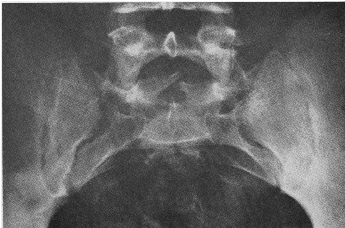
Fig. 1.—Sacro-iliitis in a patient with a past history of two attacks of polyarthritis.