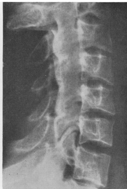
Fig. 5.—Bony fusion of apophyseal joints with early changes along the anterior vertebral bodies (Case 4).

percentage incidence of sacro-iliitis similar to that quoted by Dr. Ansell (16·8 per cent.).