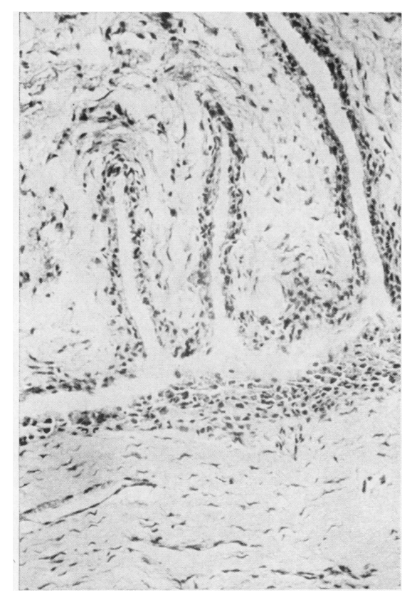
Fig. 1.—Case 1, synovium of shoulder joint, showing cell proliferation of the synovial lining and scanty infiltration with chronic inflammatory cells.

Biopsy. —Synovial membrane of the left shoulder joint showed slight hyperplasia of the synovial lining cells, scanty infiltration with lymphocytes and macrophages, and increased vascularity (Fig. 1).