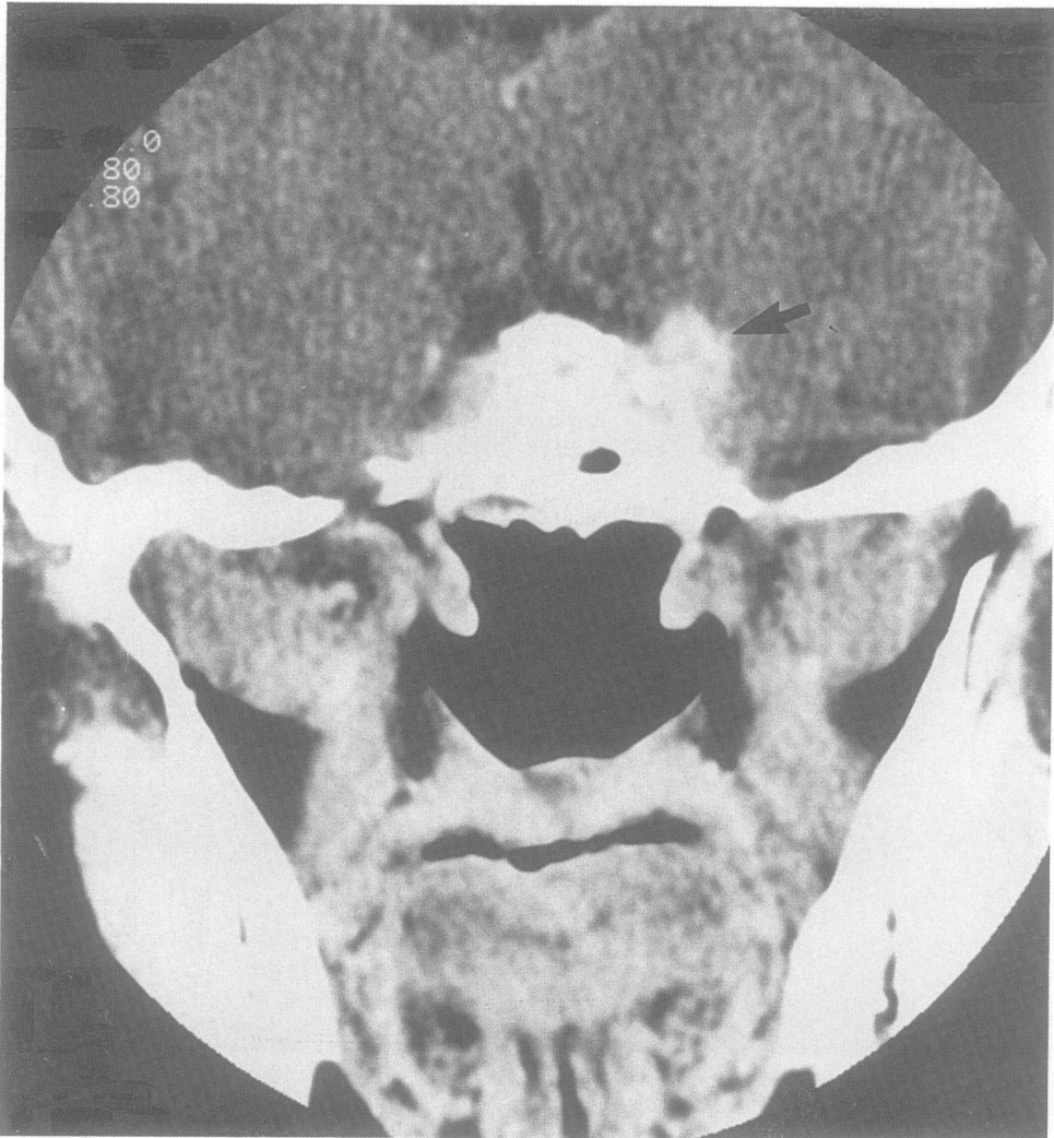
Fig 2 A cerebral CT scan with intravenous contrast showing a coronal slice through the anterior cranial fossa. A contrast-enhancing lesion is again demonstrated near the medial wall of the cavernous sinus.

original findings reported by Tolosa. 1 The case was somewhat atypical in that the patient's retro-orbital pain was often throbbing whereas the pain in this condition has usually been described as boring or stabbing. 8 The patient's pain did assume a stabbing quality for a short period before operation.