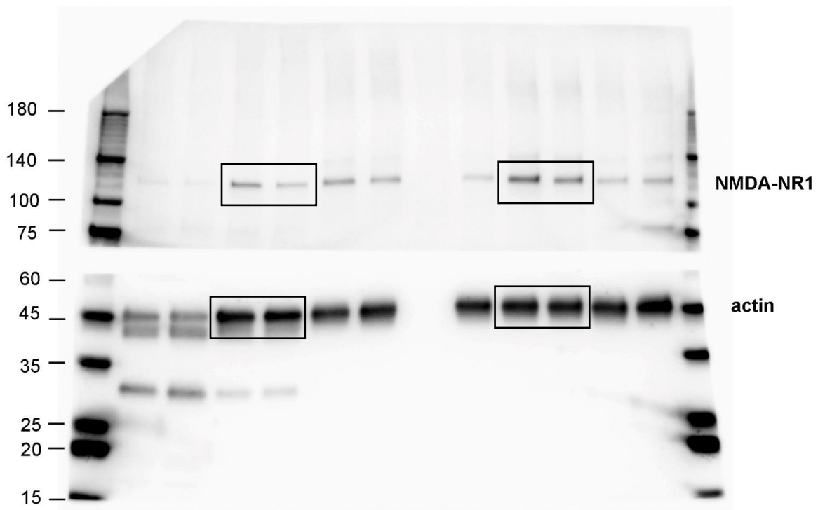
Full unedited blot for fig. 6 A