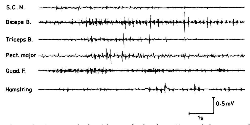
Fig 1 Surface electromyography of case 1 during standing. Irregular repetitive group discharges were noted in sternocleidomastoid (SCM), biceps brachii, triceps brachii, pectoralis major, quadriceps femoris and hamstrings. There was no apparent reciprocal discharges between agonist and antagonist muscles.

Laboratory examination revealed a peripheral white blood cell count of 8100/mm<sup>3</sup>. Erythrocyte sedimentation rate was 20 mm/lh. CRP was 1 + . Other routine blood and urine tests were normal. Immunoglobulin was normal. Serological tests for syphilis were negative. Serum viral titres for Influenza A and B, mumps, Coxsacki B, Epstein-Barr virus were normal. Cerebrospinal fluid examination on the 8th hospital day showed cells 13/mm<sup>3</sup> and protein 94 mg/dl. Cranial computed tomography, electroencephalogram, auditory brain stem response and sensory cortical evoked response in the upper extremity were all normal. Electro-oculography showed continuous abnormal eye movements without intersaccadic latencies which was exaggerated by fixation, calculation and eye-closure. Surface electromyography on biceps brachii, triceps brachii, quadriceps femoris and hamstrings showed repetitive irregular group discharges with no apparent reciprocities. Blink reflex test showed reduced