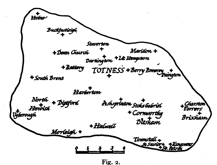
Area served by the Totnes Guardians From Report of the Select Committee on Medical Poor Relief, p. 845

advertising for tenders from the medical profession and had reported to this effect. The committee considered