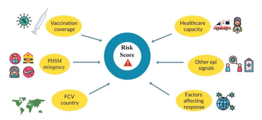
Figure 2.1 Indicators used to form the context risk score where 'vaccination coverage', 'PHSM stringency', 'FCV country' are prepopulated using existing data and 'healthcare capacity', 'other epi signals' and 'factors affecting response' are manually updated

The revised context assessment framework is based on a point-based system for a set of selected indicators. Each level of a particular indicator is assigned points in terms of the weight of evidence it provides for a potentially bad COVID-19 situation in the country within the coming weeks. The assigned points are then summed up to determine an overall score. An upgrade of the dynamics classification would be recommended if the score passes a given threshold. Because the degree of certainty about the different indicators can vary substantially between countries and settings, the framework also takes the level of trust around the different indicators into account.