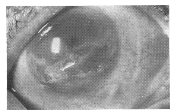
Fig. 3 Case 2294. Vascularised corneal scar with advanced iris atrophy and nonreacting pupil. The ragged outline of the pupil margin associated with loss of iris stroma is visible above the corneal scar. Vision, counting fingers.

cytes and plasma cells. Sphincter intact but there was a complete absence of the dilator muscle.