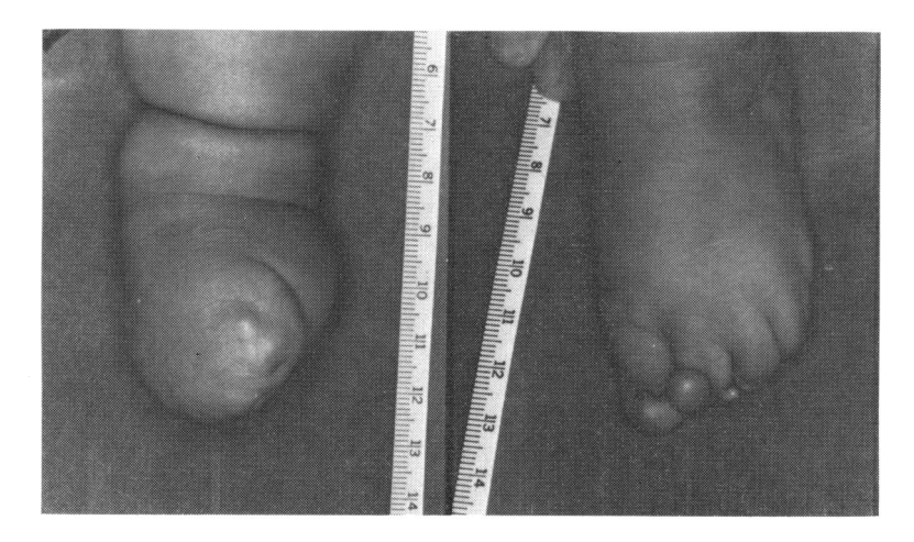
Fig. 3 Patient with amniogenic band syndrome showing absent right foot and ring constriction of lower leg (left) and ring constriction of left second toe (right).