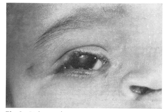
Fig. 5 Right eye of patient with amniogenic band syndrome showing upper and lower lid colobomas and corneal leucoma. Note traction groove from lower coloboma.

We found 19 reported cases of amniogenic band syndrome with eye findings and have summarised these cases in Table 1. Findings in our patient that were similar to those previously reported included upward slant of the palpebral fissures, bilateral upper and lower lid colobomas, telecanthus, and bilateral corneal opacities. The lid colobomas may have been the result of traction on the lids by the amniotic bands, though no such band was seen at birth in our patient. The corneal opacities may have been caused by amniotic band adhering to the cornea with possible perforation. Before the ocular findings