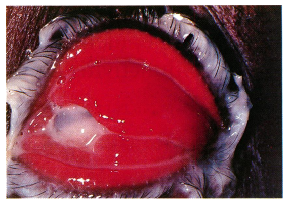
Fig. 2 Patient 13, 30-year-old female. N. gonorrheae corneal perforation and endophthalmitis, OD.

ocular involvement was bilateral and no patient reported any ocular disorder or injury prior to the onset of conjunctivitis.