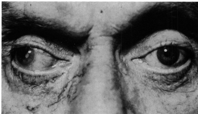
Fig. 1 Divergent right eye with no evidence of Kayser-Fleischer ring. Left eye has a dense Kayser-Fleischer ring.