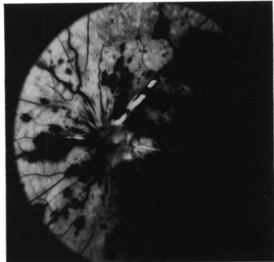
Fig. 2 Fluorescein angiogram frame of the left eye one day after injury (146 seconds after injection).

as leukaemia, 1 Behçet's disease, 1 septic cavernous sinus thrombosis, 1 subacute bacterial endocarditis, 1 systemic lupus erythematosus, 2 syphilis, 3 and temporal arteritis. 4 It is possible that in some of these cases the arterial and venous occlusions may not have occurred simultaneously.