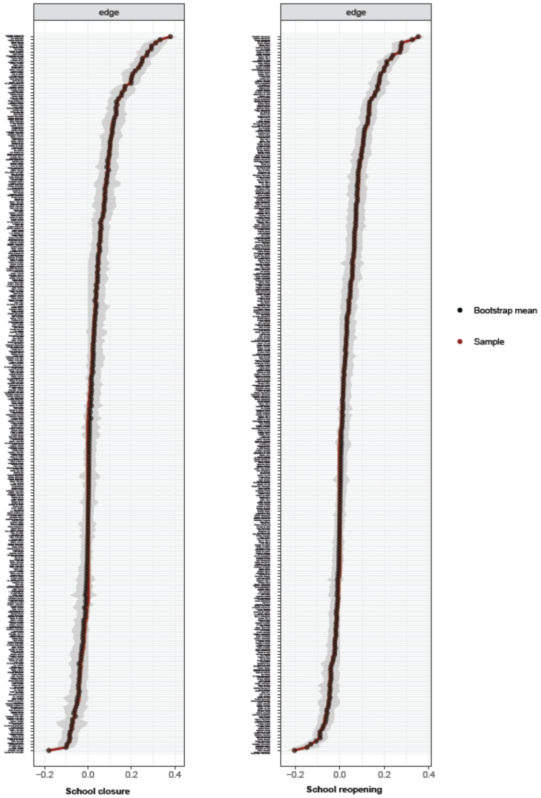
Figure S1 Stability of Edge Weights at two stages