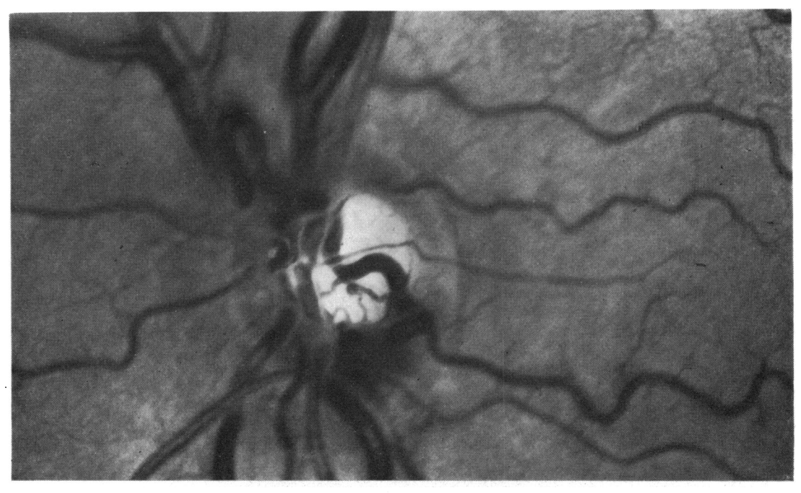
FIG. 2 (Patient 16) Multiple venous loops in patient with glaucomatous cupping and no loss of visual field

End stage glaucoma refers to eyes with a central field of 10° or less, or a residual temporal island. Early to moderate glaucoma refers to eyes with raised intraocular pressures and definitely cupped optic discs with visual field loss ranging from minimal or no field-loss to a loss of approximately one-half of the visual field.