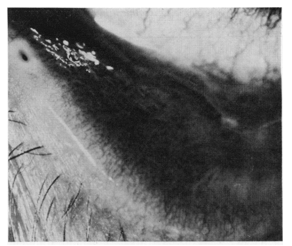
Fig. 2 Lower fornix showing follicular reaction and conjunctival scarring