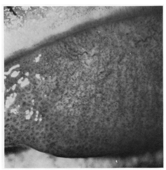
Fig. 1 Everted upper lid showing papillary reaction