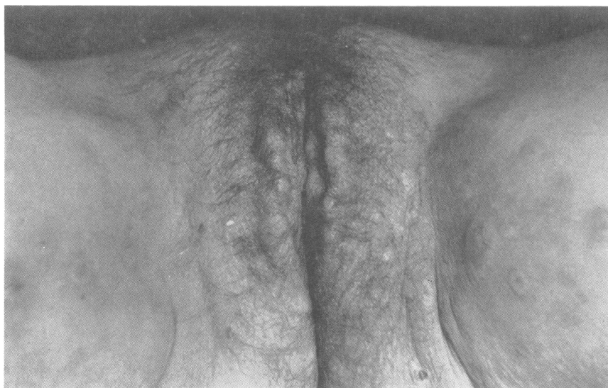
FIG. 2.—Symmetrical distribution of ulcerated lesions of herpes genitalis on the vulva extending into the groins and on to the thighs.

The perianal region, anus, and anal canal may be involved in both males and females, and in the former may be the result of homosexual contact (Hutfield, 1963a). The eruptive phase is usually preceded by irritation, burning, or pain. This is followed by the appearance of one or several groups of vesicles arising from an inflamed base; if the lesions are multiple they may coalesce to form bullae, which are more common in females. The vesicles soon rupture to form soft non-indurated ulcers, but secondary infection of these may lead to balanoposthitis in the male or vulvo-vaginitis in the female. Secondary infection may also result in persistence of irritation, burning, or pain until the lesions have healed. It is not usual, however, for herpes ulcers to become infected with secondary organisms until they have persisted for at least 5 days. Once infected the ulcers discharge pus or blood and eventually dry and become crust-coated. In the course of a few days, the crusts fall off and the underlying tissue heals. Successive crops, however, may prolong the disease for several weeks. Tender enlargement of the regional lymph glands may occur, especially in the presence of secondary infection, which is probably more common in the genital region than in other parts of the body owing