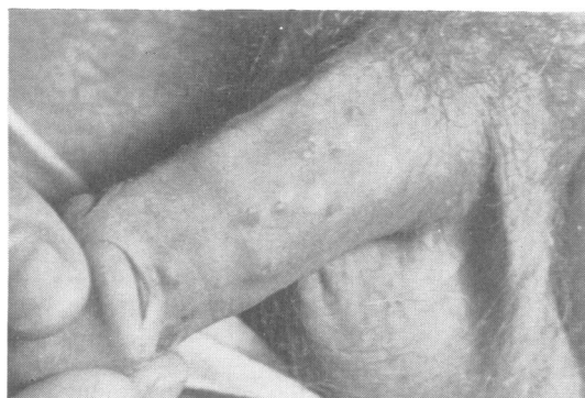
FIG. 1.—Vesicular eruption of herpes genitalis on the glans and shaft of the penis.

In the male, the lesions usually appear on the glans penis, prepuce, or balano-preputial sulcus. They may occur on the shaft of the penis and rarely on the scrotum or thigh (Fig. 1). The urethra or bladder may also be involved, giving rise to a urethritis (Harkness, 1950) or a cystitis (Schiffmann, 1926) respectively.