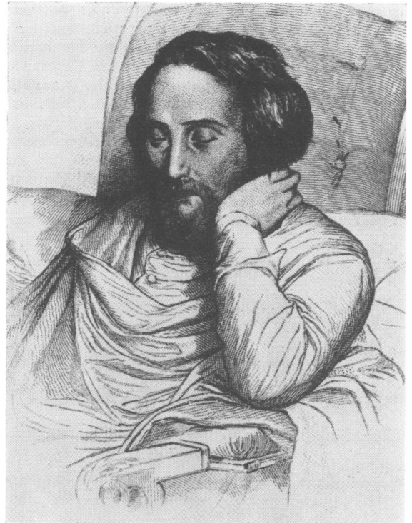
FIG. 2 Heinrich Heine lying on his 'mattress grave' paralysed by locomotor ataxia. He lay thus for 8 years