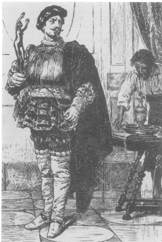
FIG. 5 Benvenuto Cellini (1500–70), the celebrated Italian goldsmith and jeweller, extolled guaiacum as the drug which cured his syphilis

It is often said that soldiers and sailors worship Venus as ardently as Bellona, and of soldiers the one most remembered is Napoleon who contracted gonorrhoea when a young army lieutenant in Paris. It was said that the affair took place against a convenient wall near the Tuileries. Cure took some time and he suffered a good deal from stricture; he was often to be seen in a characteristic posture with his head resting on his raised right forearm as he endeavoured to urinate against a tree. At his post mortem examination stones were found in his bladder. His scabies contracted in Toulon may well have been sexually acquired; it tormented him for many years until he was cured by Corvisart. It is also said that he acquired