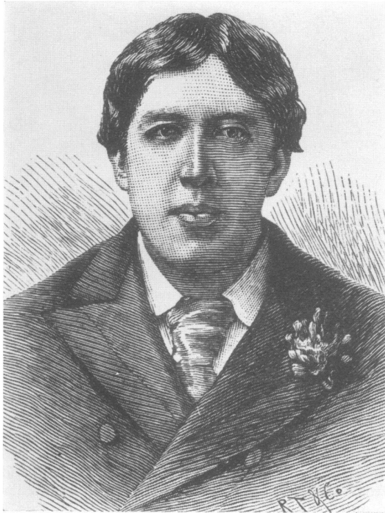
FIG. 3 Oscar Wilde, who contracted syphilis while an undergraduate at Oxford, died from an unassociated brain abscess in 1897

he refers to the disastrous consequences of their association. He received huge mercurial inunctions which left his teeth severely damaged. He had a medical examination before he married Constance Lloyd, and she gave birth to two healthy sons, but after the birth of the second his syphilis manifested itself again. He died in the Rue des Beaux Arts in Paris, probably of a cerebellar abscess due to otitis media consequent, he said, to falling upon his ear while in the Chapel of Reading Gaol. His grave in the Père La Chaise cemetery in Paris is now a place of pilgrimage for homosexuals.