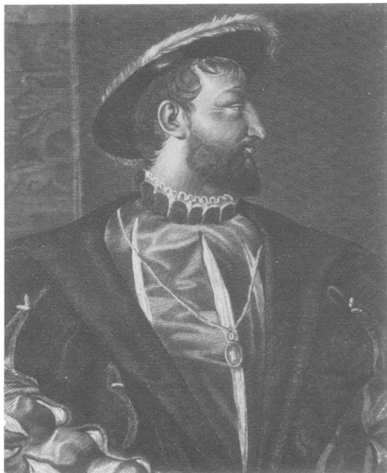
FIG. 7 François I (1494–1567), king of France, with whom Henry VIII wrestled physically as well as politically on the 'Field of the Cloth of Gold', was said to be syphilitic

Both the Emperor Charles V and Francis I, whose intrigues with and against Henry VIII of England make a most bewildering story, were said to be syphilitic. Henry VIII is generally regarded as being syphilitic because he had deep ulceration of both legs above the knees. The ulcers seemed to be sinuses of