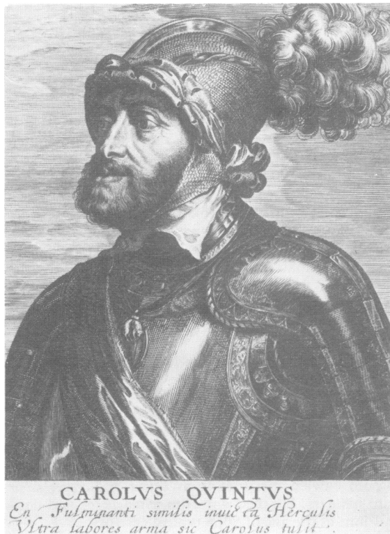
FIG. 6 Charles V (1500–58), the holy Roman emperor, was infected with syphilis

Louis XIV reputedly suffered from gonorrhoea. There was no history of syphilis; his fourteen acknowledged children are indirect evidence of this.