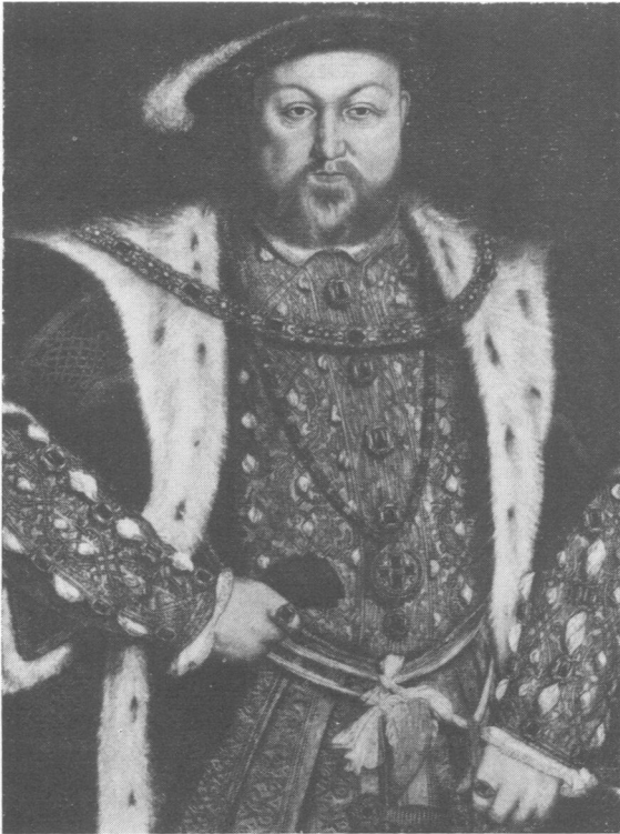
FIG. 8 Henry VIII (1491–1547), who intrigued and quarrelled during his reign with the king of France and the emperor of Germany. All three were syphilitics

Paul I of Russia was the natural son of Catherine II of Russia. His putative father Peter III was assassinated by strangulation in 1764 six hours after being forced to sign a shameful abdication and his body was brought to St. Petersburg for a lying-in-state, where his death was announced as due to a 'haemorrhoidal' colic. Paul I (to be) developed a syphilitic nose at about the age of 10 and it became quite typical as he