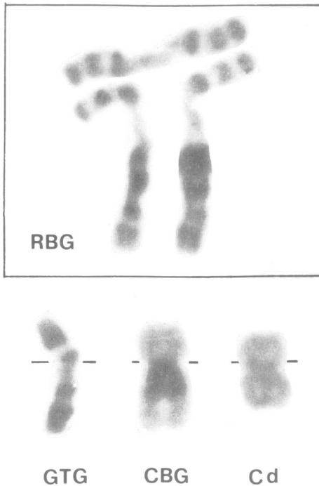
FIG 2 (Top) Two normal and one abnormal chromosomes 9 (RBG banding). (Bottom) Cytogenetic details of abnormal chromosome 9 (GTG, CBG, and Cd banding).

Beutler's method 3 and showed a GALT excess (35.18 IU/g Hb at 37°) which, compared with the midparent value (16.78 IU/g Hb), demonstrated in the patient a tetraplex gene dosage effect (2.09).