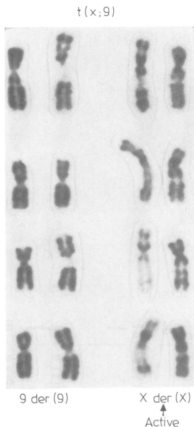
FIG 2 BrdU substituted Hoechst-Giemsa stained partial karyotypes for the X and 9 chromosomes. Note that the normal X chromosome is the late replicating or inactive X chromosome in all examples.

The patient was referred for cytogenetic evaluation. A buccal smear was obtained which was 34% positive for Barr bodies (laboratory range for females is 15 to 40%). Chromosome studies on this patient revealed a balanced translocation between the short arms of an X and a 9, with a karyotype of 46,X,t(X;9)(p21;p22) (fig 1). The chromosomes of the parents and both sibs were normal. Thus, the translocation in this patient can be interpreted as a de novo event. Replication studies were undertaken to determine the pattern of X chromosome inactivation in the patient. A terminal pulse of 5-bromodeoxyuridine was added to cells in culture, and the resulting chromosomal preparations were stained with the modified Hoechst-Giemsa technique previously described. 7 In all but one of 82 differentially stained metaphases, the normal X chromosome was inactive or late replicating (fig 2).