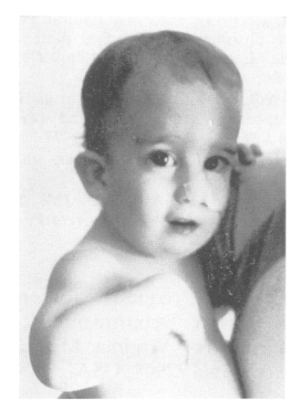
FIG 1 The proband at 10 months of age.

weight on appropriate therapy. IVP and abdominal CT failed to visualise the left kidney. An absent left ureteral orifice and a right sided ureterocele were found at cystoscopy. An atrophic left kidney was identified and removed at laparotomy. The patient returned to hospital several times because of intermittent febrile episodes (38 to 39^{\circ} C). The aetiology of these episodes was never determined despite numerous cultures and immunological studies.