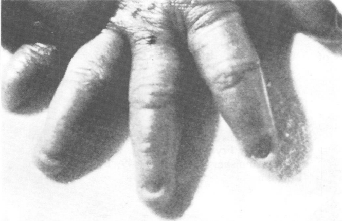
FIG 3 Hypoplastic terminal phalanges of all fingers and toes with small nails.