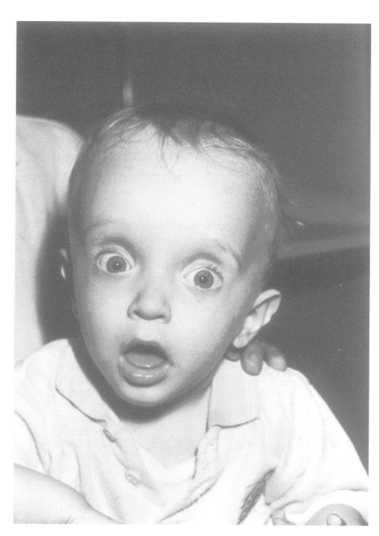
Figure 3 A 2 year old boy with Cowden syndrome. Note severe macrocephaly.

The Cowden syndrome is inherited as an autosomal dominant trait.2 Clinical expression can show great variability. This may not be caused solely by the fact that a great variety of organ systems can be involved. In several families aggravation of clinical signs and symptoms in subsequent generations has been noted. Transmission through affected males resulted in earlier onset of clinical signs and in somewhat more severe expression. Transmission through affected females, however, not only showed earlier expression of the symptoms, but also an undoubtedly much more severe clinical syndrome, even resulting in mental retardation. Carlson et al8 reported a four generation family with members affected in every generation. Transmission through the female line in this report appeared to result in earlier and more severe clinical expression of signs. Transmission through a male member of the family gave earlier onset of symptoms, but of more or less the same severity. Variable expression in members of the same generation was also noted. Starink et also reported one family