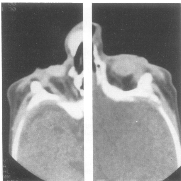
FIG 2 Computerised tomography of the head showing bilateral ocular hypoplasia.