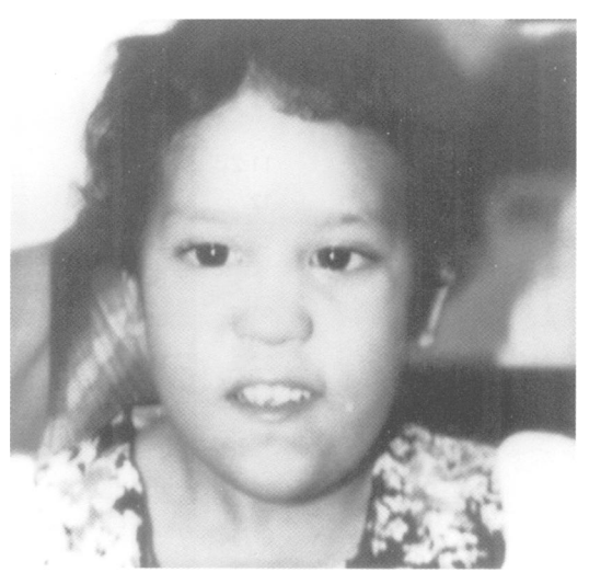
Figure 1 Patient at 3 years 9 months of age.

The patient was a 3 year 9 month old Puerto Rican girl born at 34.5 weeks' gestation with a birth weight of 2580 g (75th centile) and a birth length of 47.5 cm (80th centile). The exact head measurement at birth was not available, but was reportedly in proportion to the body size. There was no history of mutagenic or teratogenic exposure, and the parents were in their early 20s at her birth. The mother's karyotype is 46,XX, but the father was unavailable for cytogenetic study. The family history is not further contributory and there is no consanguinity. According to the mother, during the first 2 months of life, the patient had "a