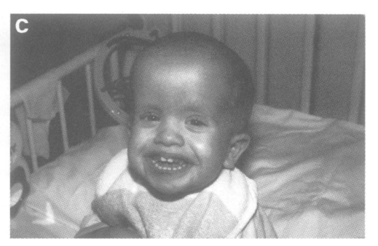
Figure 2 (A) Case 2 at 15 months. (B) Excess palmar skin. (C) Case 2 at 3 years.

At 4 months, she was re-referred to a paediatrician for investigation of persistent failure to thrive and vomiting despite continuous nasogastric feeds. Upper gastrointestinal endoscopy showed mild inflammation at the lower end of the oesophagus while a 24 hour pH study, on antireflux therapy, showed no residual reflux. Following her endoscopy, she had several self-correcting episodes of supraventricular tachychardia and bundle branch block. A contrast swallow showed poor suckswallow coordination.