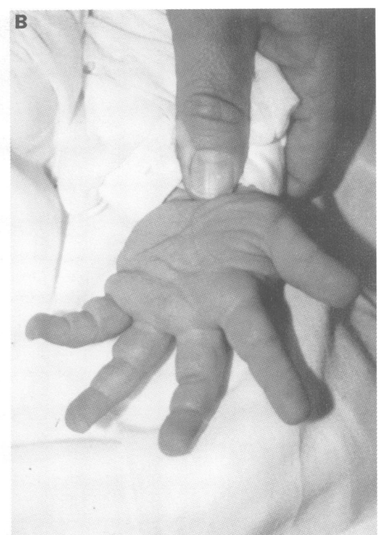
Figure 1 (A) Case 1 signing "home" at the age of 3. (B) Case 1 showing excess palmar skin with deep creases and marked hyperextensibility of the small joints of the hand.

She continued to have intense problems with feeding and slow weight gain. By 5 months her weight and height were below the 3rd centile and have continued to parallel the 3rd centile since. She initially was tried on intermittent nasogastric tube feeding to supplement calorie intake. This having failed, she went on to have regular night time tube feeding. At 6 months, she began to fix and follow and smiled. She rolled and began to vocalise at 8 months. She was sitting unaided at 18 months but was unable to pull to a sitting position on her own until the age of 2.