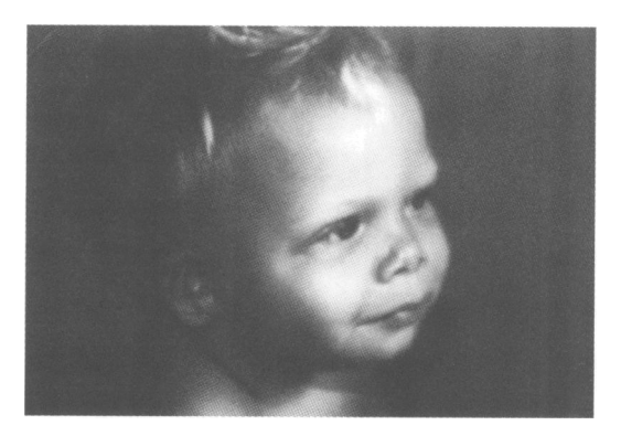
Figure 1 The proband at the age of 21 months.

Genomic DNA was isolated from peripheral blood samples by standard methods.<sup>8</sup> Three microsatellite markers of chromosome 1q were analysed, D1S104, D1S1167, and D1S158, located in 1q21-23, 1q21.3-q23.2, and 1q24qter, respectively. PCR amplification of D1S104 (GDB 177300), D1S1167 (GDB 309963), and D1S158 (GDB 182041) was performed in a DNA thermal cycler 480 (Per-