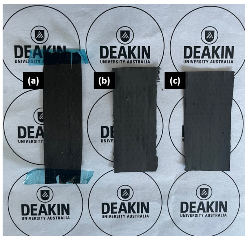
Figure S1. A picture of LiFePO 4 coating performance onto carbon fibre tow (CF); (a) carbon fibre tow substrate which is fabricated PVDF binder prior to coating LiFePO 4 (b) 90 LiFePO 4 /CF and (c) 78 LiFePO 4 /CF.

*Corresponding Author: minoo.naebe@deakin.edu.au