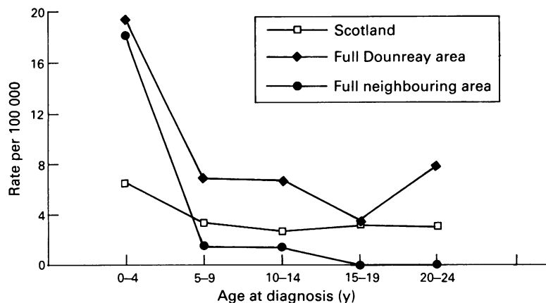
Figure 2 Incidence of leukaemia and non-Hodgkin's lymphoma by age at diagnosis in the 'full Dounreay area', 'full neighbouring area', and Scotland, 1968-91.